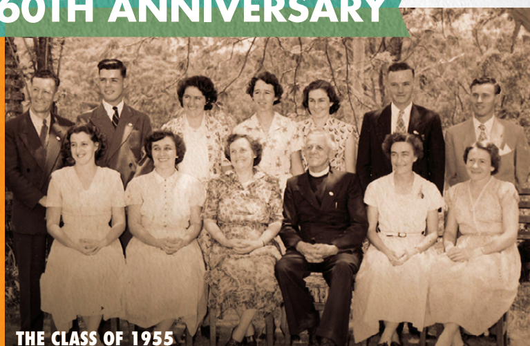
THE CLASS OF 1955