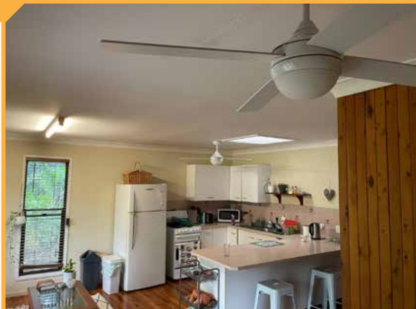
Thanks to the generous family and friends of our 2020 graduating class, future students and families will enjoy the benefits of cooling fans to help battle the hot Brisbane summers.

Your greatest fans aren't the ones spinning on the ceiling—they're the students and families sitting under them!