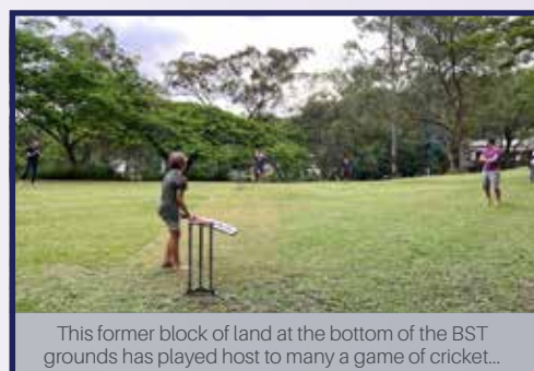
This former block of land at the bottom of the BST grounds has played host to many a game of cricket...

I'm going to miss looking out on that special front lawn each day. But the view