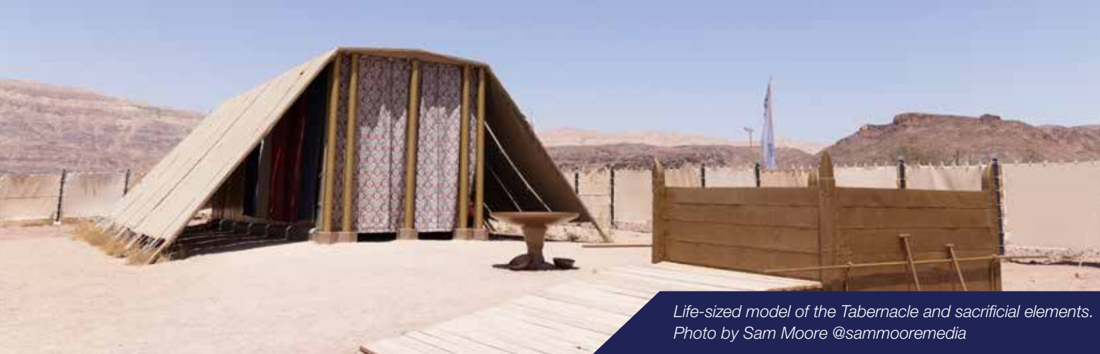
Life-sized model of the Tabernacle and sacrificial elements.

“My trip to Jordan and Israel was not only an incredible exploration of history and archaeology, but an important time of reflection on the faith I share with centuries of Christians and Messianic Jews.”