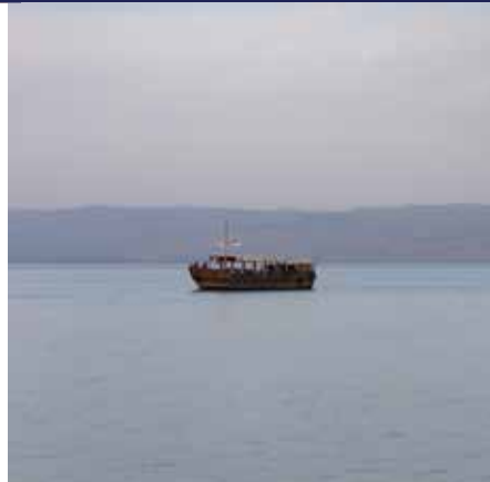
Sea of Galilee (above). Ancient Millstone (below).