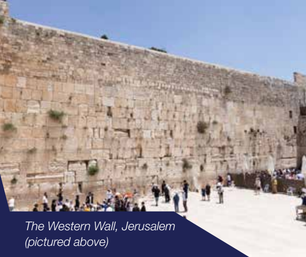
The Western Wall, Jerusalem (pictured above)