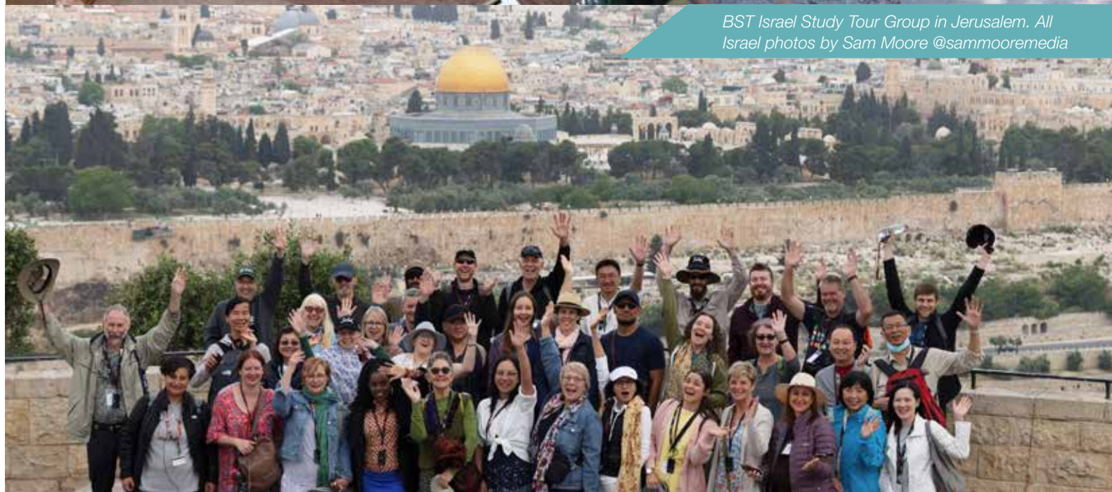
BST Israel Study Tour Group in Jerusalem.