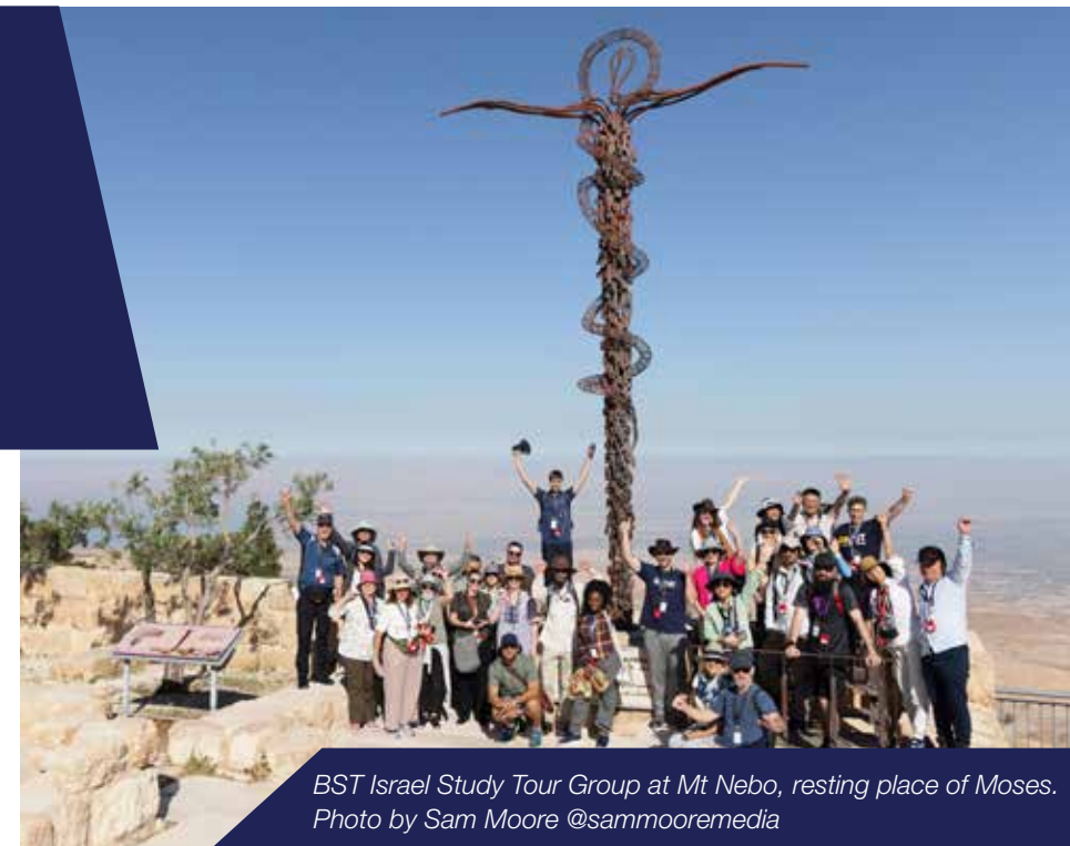
BST Israel Study Tour Group at Mt Nebo, resting place of Moses.

The first few days saw the group travelling throughout Jordan, visiting the resting place of Moses at Mt Nebo, where he finally saw a view over the